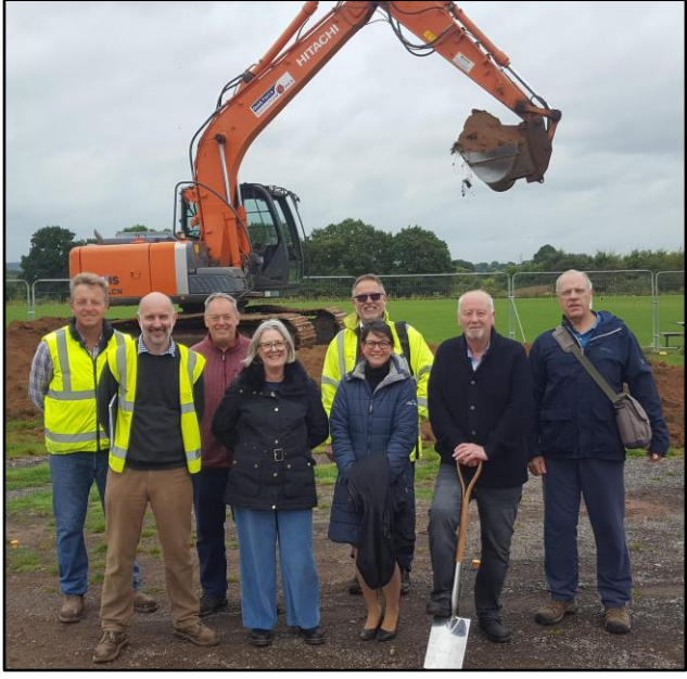
▲ More turf cutting in September 2022 – this time marking the beginning of the construction of the Ingrams Sports Pavilion on 30 September 2022. The Town Council is delivering the Pavilion from Section 106 funding, a contribution from Sport England and £301,750 from its own general reserves.

For further information please contact Janine Gardner, Town Clerk, on tel. 01404 514552, mob. 07746 909933 or email clerk@cranbrooktowncouncil.gov.uk